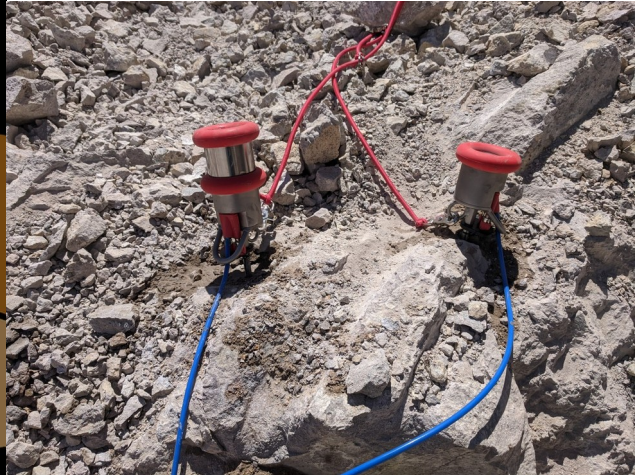
Figure 2: A two-head Micro-blaster system prepared for use.