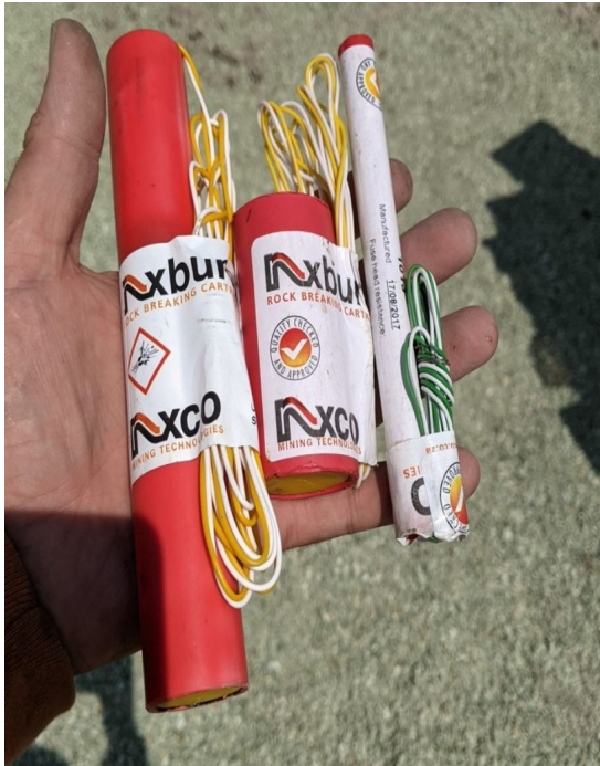
Figure 3: 40g, 20g and 10g class 1.4 blasting cartridges