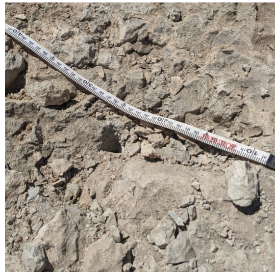
Figure 5: Typical shaped charge results on bedrock. 10-22cm penetration and a shallow crater left behind.