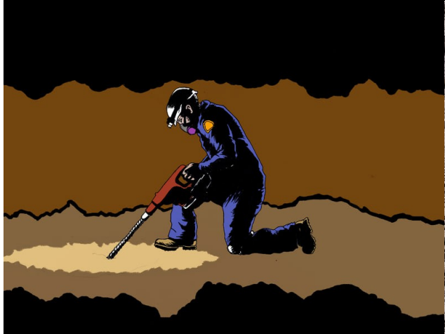
Figure 1: Drilling a wedge cut to lower the floor in a cave passage.