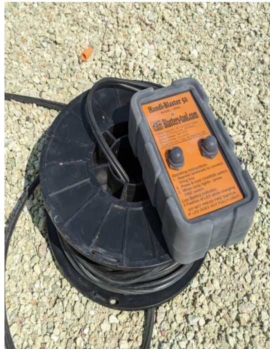
Figure 4: A 50-cap blasting machine and 25m firing line for 1.4 product